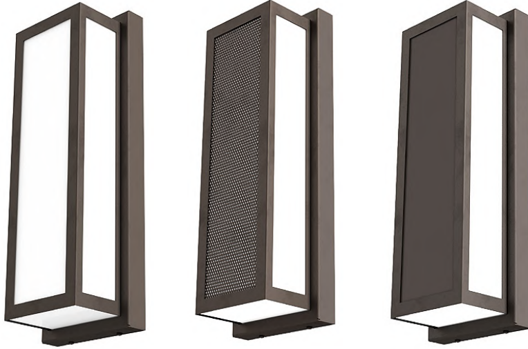
Rectangular Windows (RW)